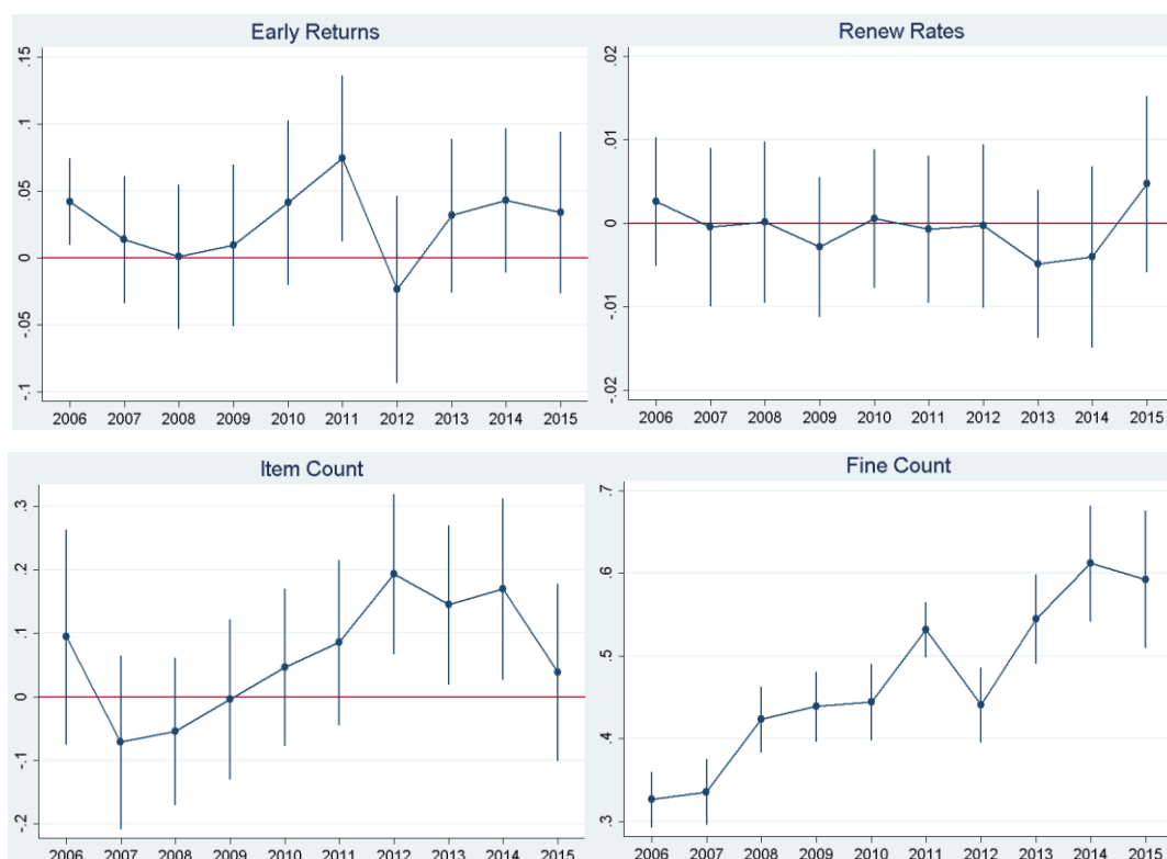
Figure 2. Dynamic Effects of a Fine over Distinct Library Performance Measures, 2006-2015.

Source: author's calculations, based on library data.