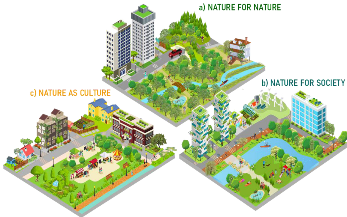
Fig. 2. Visual representations of the visions for each of the three Urban Nature Futures .

rivers as living systems, especially in the management and restoration of freshwater biodiversity and riparian buffer zones. Rewilding is promoted as a management strategy in large portions of the city parks, where soft management practices are implemented leading to an increase in the complexity of understory vegetation. Ecological corridors connect urban green areas to wider landscapes. Urban dwellers value nature intrinsically and experience wildlife through various activities such as bird watching and walks in the woods. There is education on biodiversity conservation, which in turn contributes to ecosystem protection and restoration. Housing and city infrastructure are designed to